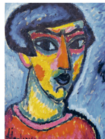
Alexej von Jawlensky Head in Blue, 1912 Buchheim Museum der Phantasie

The Five Lakes' Region is the most popular destination for day-trips from Munich. The lush green hills with Lake Starnberg, Lake Ammer and a number of smaller lakes offer breathtaking views of the Alps. Unspoilt farming villages, grand villas, Baroque churches, monasteries and castles characterise this unique area. Attractive cycling and hiking trails around the lakes and in the hills as well as lakeside beaches and trips on the lakes are an eldorado for holidaymakers. South of the lakes, further art treasures wait to be discovered: the exquisite stucco of the Wessobrunn School in the former Wessobrunn Abbey, the columned hall of STOA169 in the middle of the countryside and the sculpture trail that connects the picturesque Old Town of Weilheim with the River Ammer. One undoubted highlight is the Buchheim Museum der Phantasie that Günter Behnisch, the architect of the Olympic Park in Munich, composed for a site in Bernried right on the shore of the lake. In addition to the famous collection of Expressionist works amassed by the author of »The Boats,