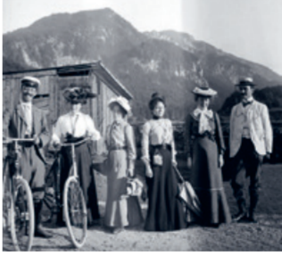
Picture credits: Cover: Erich Heckel, Sleeping Pechstein, 1910 (Detail), Buchheim Museum, Bernried ©Estate of Erich Heckel, Hemmenhofen | Bayerische Seenschiffahrt: Tourist Information Starnberg | STOA169: Photo Erwin Rittenschöber | Polling artist's village: Marian Zazeela, ©La Monte Young and Marian Zazeela 2001 | Münter-Haus: Photo Wolfgang Ehn | Kochel- and Walchensee: Tourist Information Kochel a. See, Photo Thomas Kujat | Academy of Fine Arts Munich: München Tourismus | Panorama map: ©Tourismus Oberbayern München e.V. | Staffelsee: Photo Florian Werner | Schlossmuseum Murnau, Bildarchiv, Photo: G. Pfleger | Werdenfels line: Photo Uwe Miethel | Franz Marc Museum: Photo Doris Leuschner | Kochel- and Walchensee: Tourist Information Kochel a. See, Photo Thomas Kujat | Lake Starnberg: Tourist Information Starnberg | Buchheim Museum am Starnberger See: Photo Julia Rejmer | Lenbachhaus: © Florian Holzner | München: München Tourismus, Photo Thomas Klinger | Museum Penzberg: Photo Christian Krinninger | Osterseen: Tourismusverband Pfaffenwinkel

Starting in Munich and taking in Bernried, Penzberg, Murnau and Kochel, explore the countryside by bike that so inspired Franz Marc, Gabriele Münter and Wassily Kandinsky. Route length: 238 km www.museenlandschaft-expressionismus.de