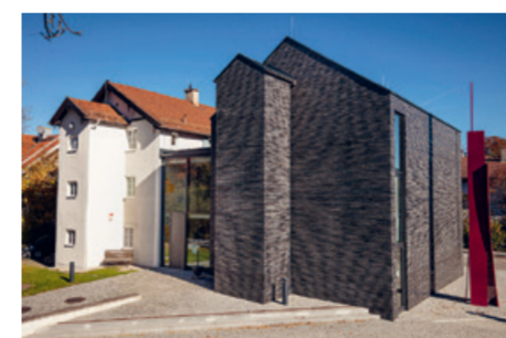
Museum Penzberg – Sammlung Campendonk

into the 1950s. Since 2016 the new Museum Penzberg – Sammlung Campendonk has been home to the largest collection of his work. With his reverse glass paintings in particular he skillfully created artworks of unique beauty and fascination.