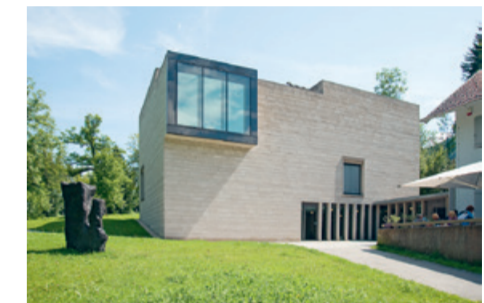
Franz Marc Museum – Art in the 20th Century