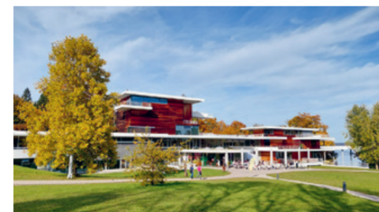
Buchheim Museum der Phantasie

Lothar-Günther Buchheim, art works collected from around the world are a true eye-opener. Children love the Circus Buffi, the submarine car, the brightly coloured helicopter and the 'Laboratory of the Imagination' where they can clamber around or make their own things. An impressive list of events attracts crowds of visitors the whole year round. The romantic park surrounding the museum is perfect for a picnic.