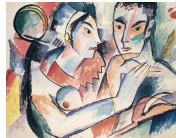
Heinrich Campendonk, Lovers (Adda and Heinrich), 1912, Museum Penzberg – Sammlung Campendonk

The area around the Osterseen lakes that stretches from Lake Starnberg southwards to the undulating foothills around Penzberg, is one of nature's real treasure troves. The 19 lakes near Iffeldorf present an impressive spectrum of colours, from silver-grey to turquoise green, set against the incomparable panorama of the Alps – a magical landscape that attracted Franz Marc to Sindelsdorf at the beginning of the 19th century. And with him his artist friends Kandinsky, Jawlensky and Münter who often spent time in the summerhouse in his garden. In 1911, at the age of 21, Heinrich Campendonk (1889–1957) came to Upper Bavaria from the Rhineland and became the youngest of the 'Blauer Reiter' artists. During his search for motifs for his paintings he was impressed by the mining town of Penzberg with its miners' houses and pitheads. His paintings from this phase were only the start of his own very independent artistic output which continued