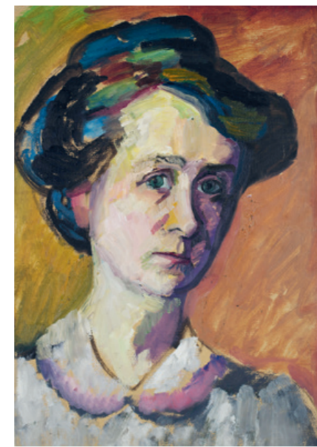
Gabriele Münter Self-Portrait 1909 Schloßmuseum Murnau

The Schloßmuseum in the castle in the centre of the town houses an exceptional collection. Its core comprises works by Gabriele Münter, the artists of the 'Neue Künstlervereinigung München' and the 'Blauer Reiter' – including Kandinsky, Marianne von Werefkin and Alexej von Jawlensky. The works exhibited show the motifs the artists found for their pictures in Murnau and the surrounding area from 1908