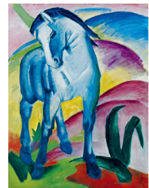
Franz Marc Blue Horse, 1911

A wealth of top-class museums and collections, displaying exhibits from Antiquity to the present day, are waiting to be explored in Munich. For many centuries, the Bavarian royal family, the Wittelsbachs, promoted the arts in the city that now boasts a centrally located 'Kunstareal' art hub with museums of world renown. This is where you will find the largest collection of works by the 'Blauer Reiter' movement, for example. The museum, partly housed in the former residence of the 'princely painter' Franz von Lenbach with its idyllic garden, is one of the most beautiful spots in the city. The house in the style of a Tuscan villa forms a stunning counterpoint to the new, gleaming golden building designed by the architectural firm Foster + Partner. Following the gift made by the artist Gabriele Münter in 1957, the museum now holds works by Wassily Kandinsky, Gabriele Münter, Alexej von Jawlensky, Marianne von Werefkin, Franz Marc, Paul Klee, August Macke and many others. Under